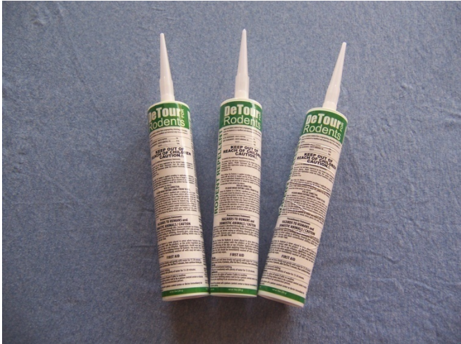
DeTour in the 10 Oz Tubes requires the use of a standard caulking gun