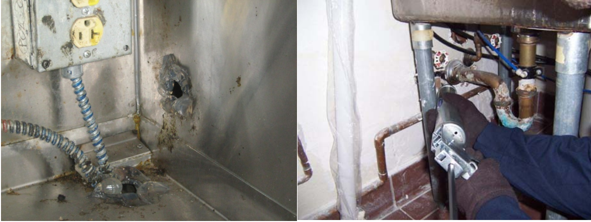
In machinery access panels apply DETOUR for Rodents around openings for plumbing, gas and electrical lines