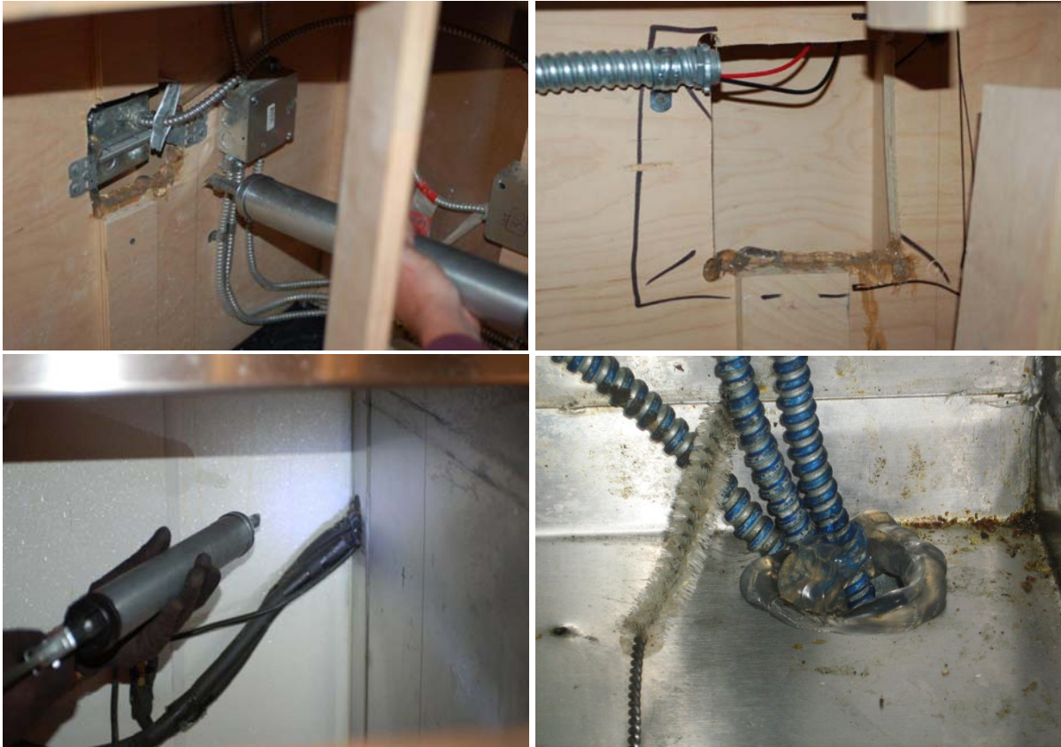
Apply DETOUR for Rodents to possible paths of travel such as interior perimeter walls, near door thresholds, at the base of columns. DETOUR for Rodents can also be brushed onto areas where a bead cannot be applied. A thick layer of DETOUR for Rodents will provide the best results.