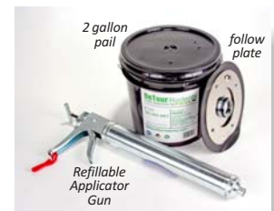
Refillable applicator gun with the follow plate and 2 gallon pail of DeTour

ALWAYS read ALL product information and the product label before application!!