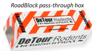
RoadBlock pass-through box