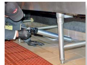
Apply DeTour beads with the optional refillable applicator gun