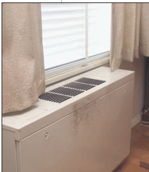
Mold growing on the surface of a unit ventilator.