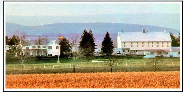
Eisenhower National Historic Site, Gettysburg PA