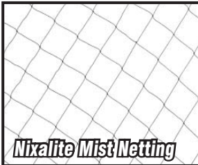
Nixalite Mist Netting