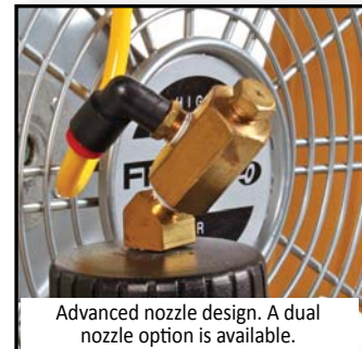
Advanced nozzle design. A dual nozzle option is available.