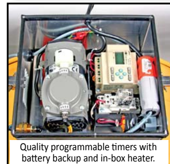
Quality programmable timers with battery backup and in-box heater.

If you have any questions on hazing, fogging or spraying systems, please contact Nixalite®